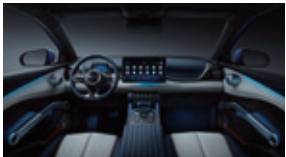
Blue and grey